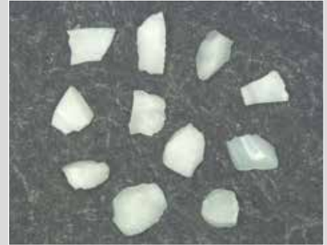
Macrostructure of 36-grit CERPASS HTB® grains.